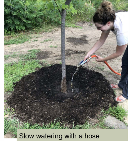
Slow watering with a hose

If winter damage to the trunk by rodents or rabbits is a concern, install a trunk guard made of plastic tubing, hardware cloth, or wire fencing. Allow 1-4 inches of space around the trunk and ensure it is tall enough to protect in snow. Remove in spring.