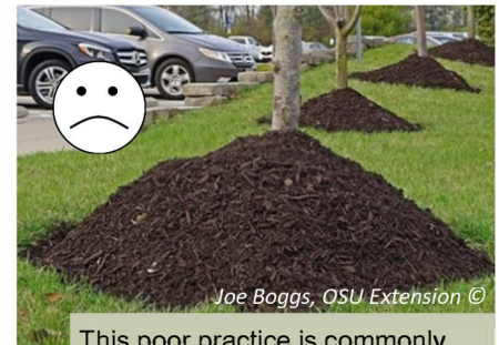
This poor practice is commonly seen in the landscape and is harmful to trees.