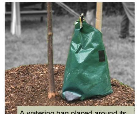
A watering bag placed around its own stake. Bags can also be placed around the trunk, but be sure to monitor the trunk for moisture and insect problems.